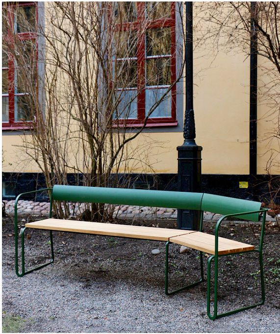
Sigill is available in a straight or, as here, an angled version. Frame powder-coated with a fine textured varnish.