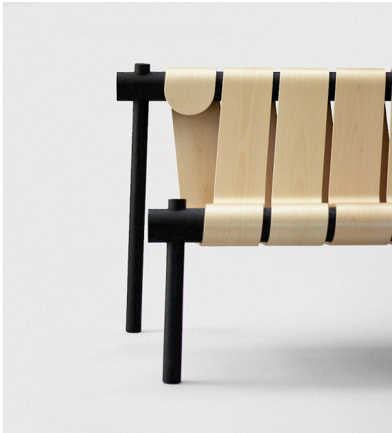
Serpentin bench creates the impression of a swirling form. At first glance, the eye can see a sleek strip of wood winding around the bars of a wooden frame.