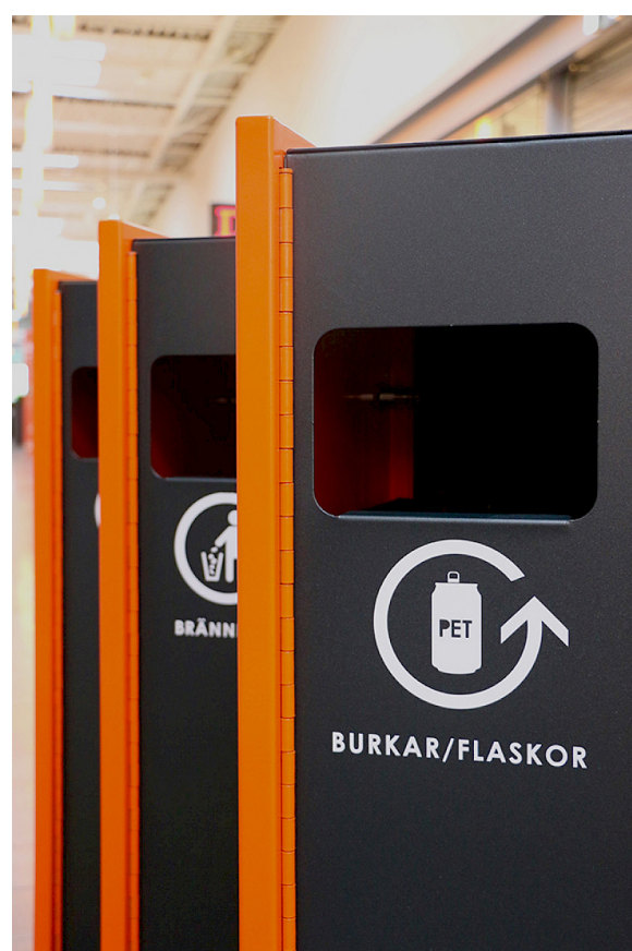
The picture shows examples of decals.