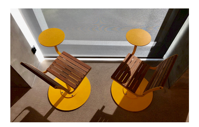
Workplaces from \ Humanisten, University of Gothenburg. \ Powder coated in RAL1018. \ Seat \ and \ backrest in cak. \ Mounted on a plate for free-standing furnishings.