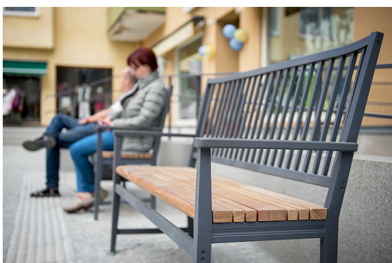
Bilder från Z-torget i Leksand kommun.