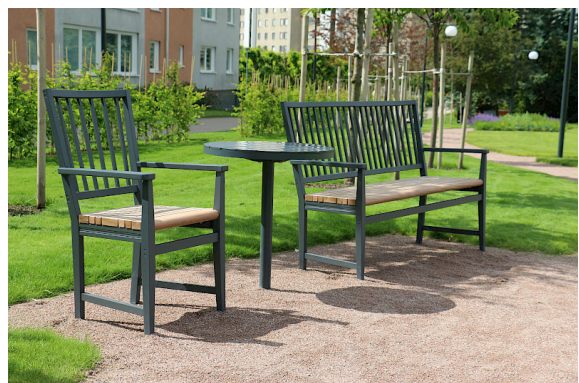
Leksand möbelgrupp i Åkerbyparken, Täby. Sittsar i obehandlad Cumaro är i stort sätt underhållsfria.