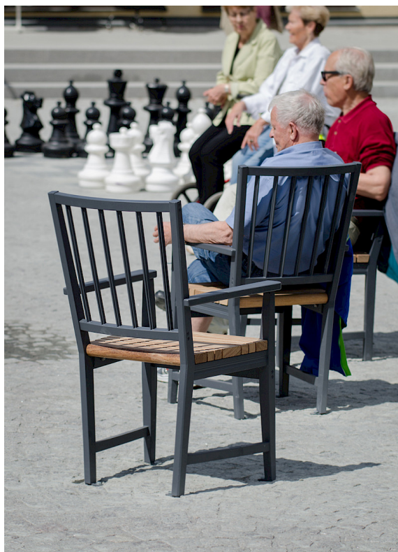
Med en lite högre sitt höjd (49 cm) är stolen tillgänglighetsanpassad. Armstöden är förlängda och greppvänliga.