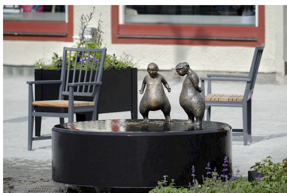
Inspirationen har hämtats från den klassiska trästolen som tillverkades i Leksand under tidigt 1800-tal.