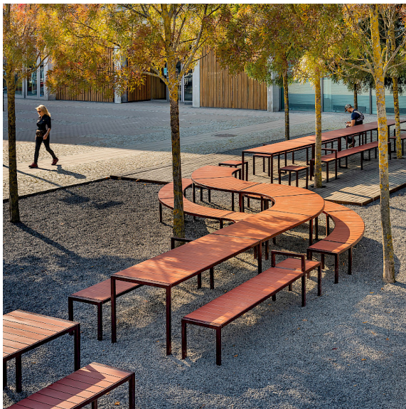
Hammtorget, Södermalm, Stockholm.