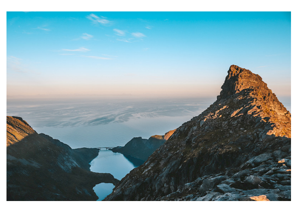
\label{lem:kebne} Kebne \ outdoor \ gym is inspired \ by \ the mountain peaks \ of \ Kebne kaise \ and \ contributes \ with \ the \ aesthetic \ value \ of \ a sculpture \ in \ an \ open \ landscape.