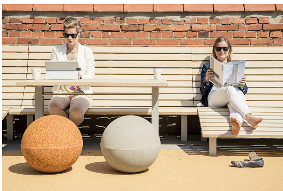
Kajen Solsoffa är ett härligt tillägg till ute kontoret Workout i Växjö.