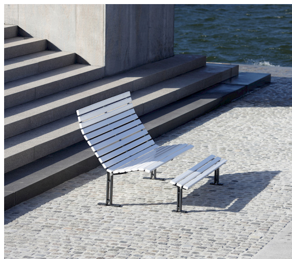
Kajen solsoffa med fotstöd i täcklaserad furu. Solsoffan kan beställas med eller utan armstöd.