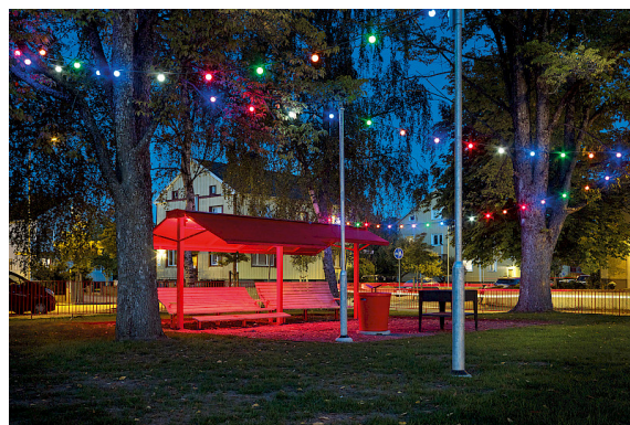
Badhusparken i Vara.