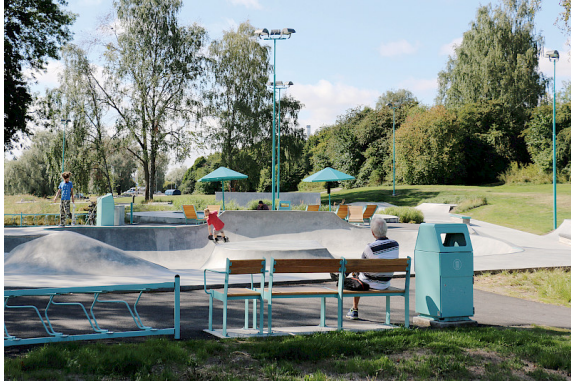
Thanks to High Chair and High Sofa, you can sit comfortably as a spectator in Västerås skatepark.