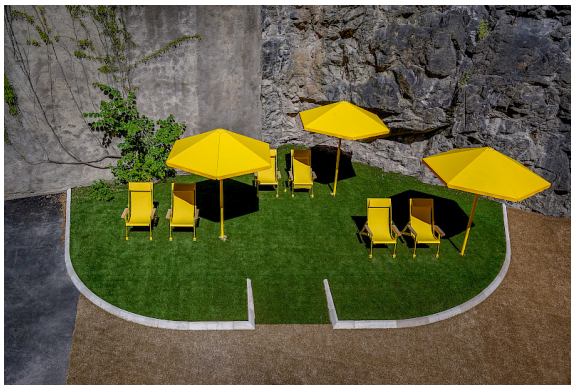
The yellow parasols can also be seen on Torsgatan in Stockholm.