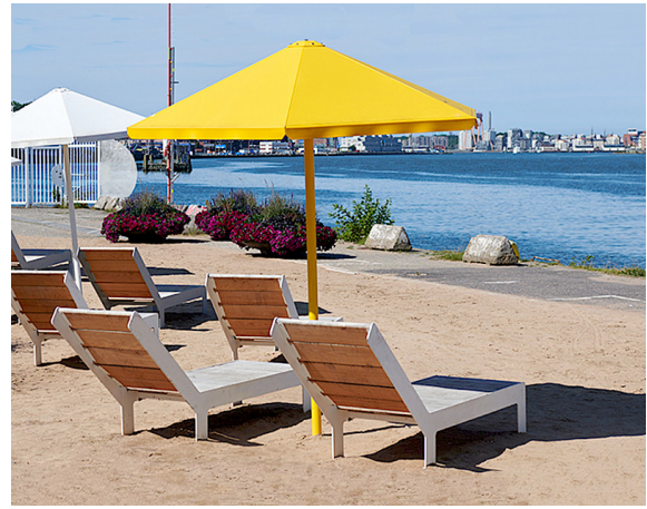
The urban beach Stenpiren in Gothenburg. Here you can see the two standard colours yellow and white.