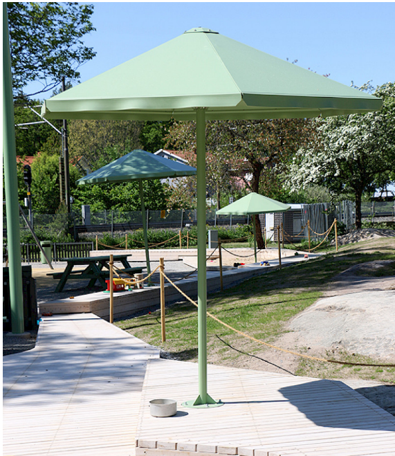
The picture shows the Four Seasons in RAL 6021. The weather protection is available in a number of additional RAL colours. Start-up cost will be added.