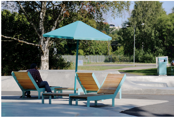
Low Bed brightens the day for the spectators at Västerås skatepark.