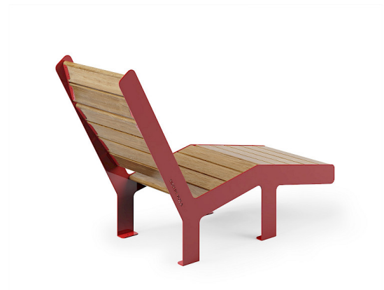
The High Sunchair was released in 2022.