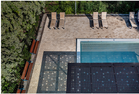
The products in the Low/High group are perfect choices for poolside patios, maritime areas, waterfront parks and beachfront terraces.