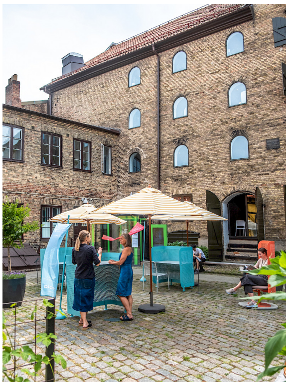
Work Desk is available in two different heights and also includes raised back and sides for privacy.