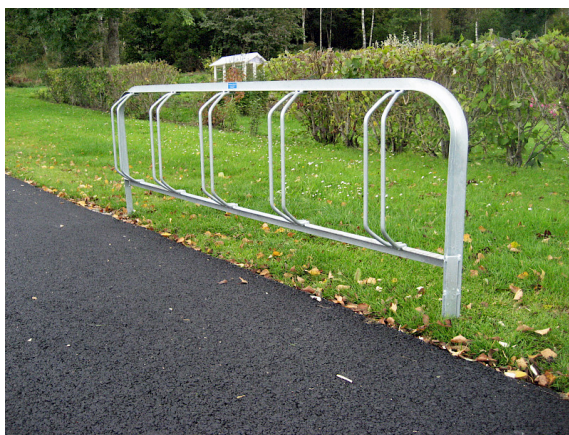
Ö03-13R, markfast cykelställ med rak inbörning