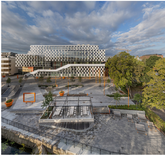
Bilden visar bland annat Terrass pergola, Parco möbelgrupp och Kagen solsoffa på gården av Mälardalens Universitet.