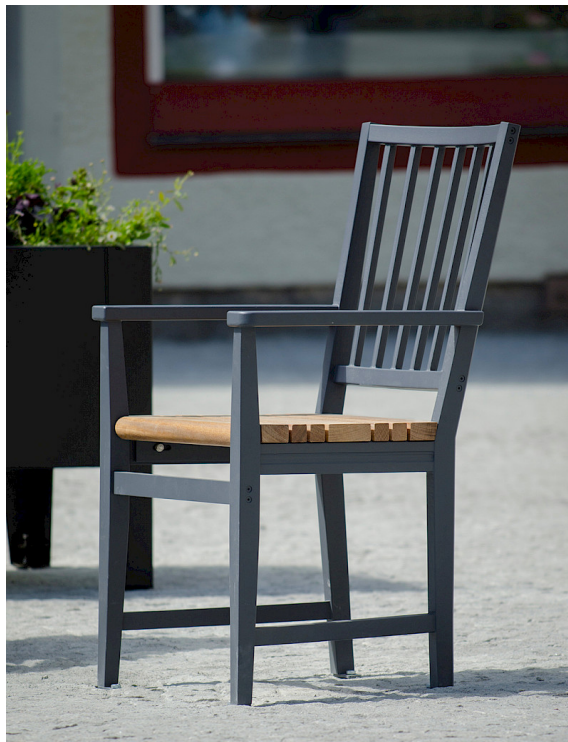
Leksand, fästölj, framtagen i samarbete med Temagruppen. Foton från Z-torget i Leksand kommun.

Inspirationen har hämtats från den klassiska trästolen som tillverkades i Leksand under tidigt 1800-tal.