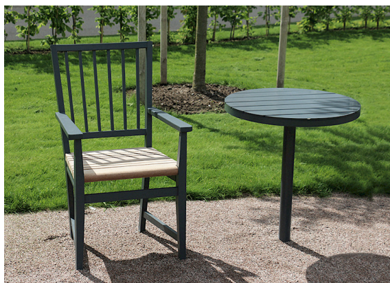
Leksand, fästölj bredvid ett runt Parco-bord.

Med en lite högre sitt höjd (49 cm) är stolen tillgänglighetsanpassad. Armstöden är förlängda och greppvänliga.