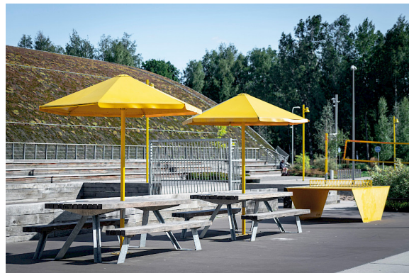
The Four Seasons sun and rain parasols designed by Thomas Bernstrand were installed in Rosendal park in Uppsala, Sweden. The parasols provides shelter and are a good placemaking tool that help strengthen the park's identity.