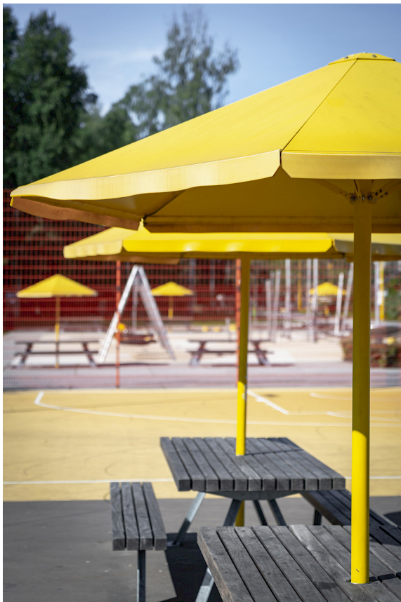
Four Seasons has an angled pole as standard, but can also be ordered with a straight post. Here in Rosendal, Uppsala.